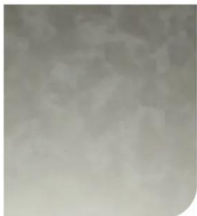
GALENA ▶ 79AZ