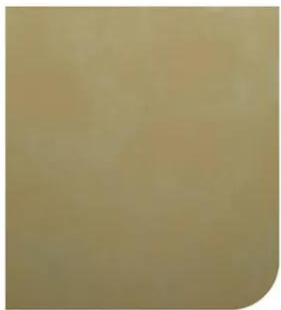
ELIODORE ▶ 79GD