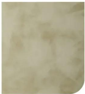
BEAUVILLON ▶ 79CH