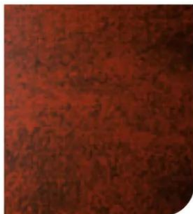
VULCANO ▶ 73VU