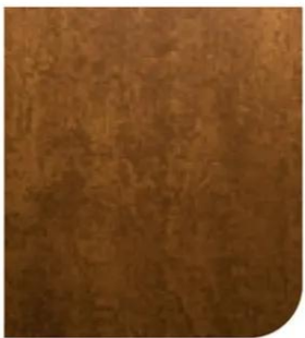
GAYA ▶ 72GA