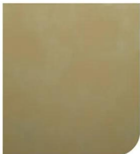
ELIODORE ▶ 79GD