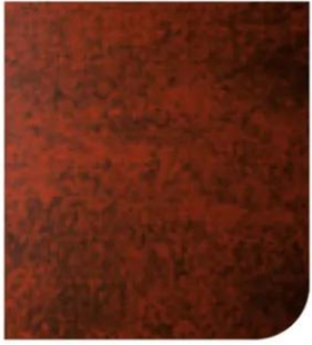
VULCANO ▶ 73VU