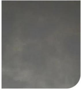
DISTENA ▶ 79MF