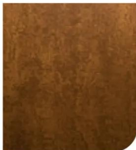
GAYA ▶ 72GA