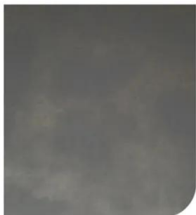
DISTENA ▶ 79MF