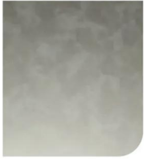
GALENA ▶ 79AZ