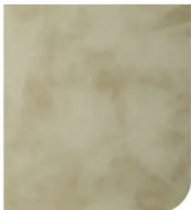
BEAUVILLON ▶ 79CH