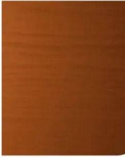
SANTAL ▶ 78B